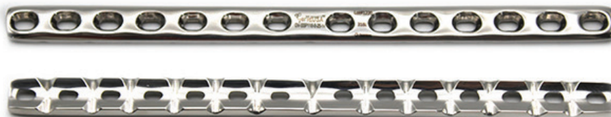
Plate 116mm Length 5mm Width 2.5mm Thickness 13 Holes