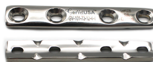
Plate 55mm Length 12mm Width 4mm Thickness 3 Holes