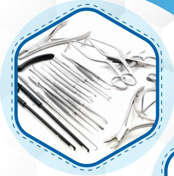
Innovative Neuro Veterinary Kit