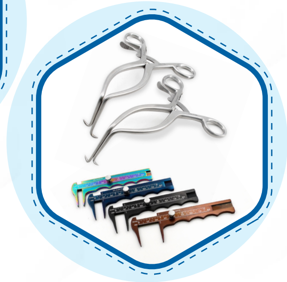
Gelpi Offset Arm Left & Right & Jameson Caliper Color Coated

If we don't have the instrument you're looking for, we will MANUFACTURE it for you!